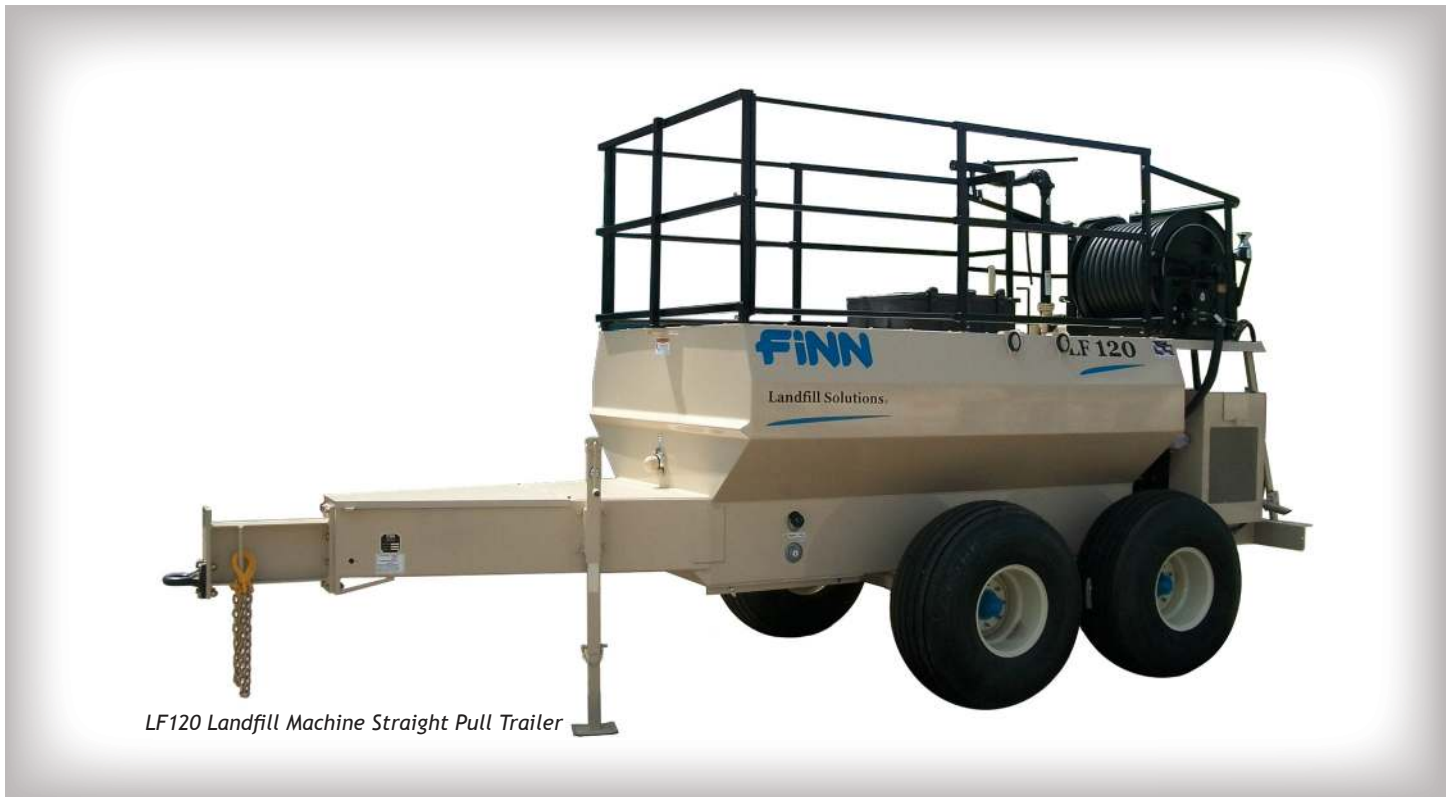
LF120 Landfill Machine Straight Pull Trailer

The FINN LF120 Landfill Machine is a real workhorse with a 1,000 gallon working tank capacity. FINN developed HydroSeeder® technology in 1953. We've been the industry leader in quality and innovation ever since. With the FINN LF120, you don't have to settle for less than proven FINN quality to tackle a wide range of highly demanding hydroseeding applications.