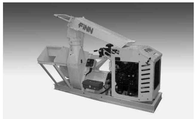
B70, Right Hand Feed, Straw Blower Skid Mounted. (B70S)

As the world leader for over 70 years in the design and manufacture of innovative, quality equipment for the erosion control industry, FINN Corporation is committed to your complete satisfaction.