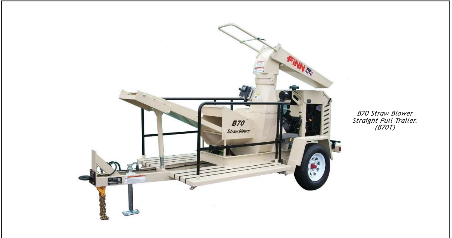
B70 Straw Blower Straight Pull Trailer. (B70T)

The FINN B70 Straw Blower is an ideal performer for all mid-size mulching needs. Designed to handle a wide variety of mulching material, the B70 gives you the high productivity and dependability that is essential for tackling home sites, industrial and commercial projects, and highway roadsides.