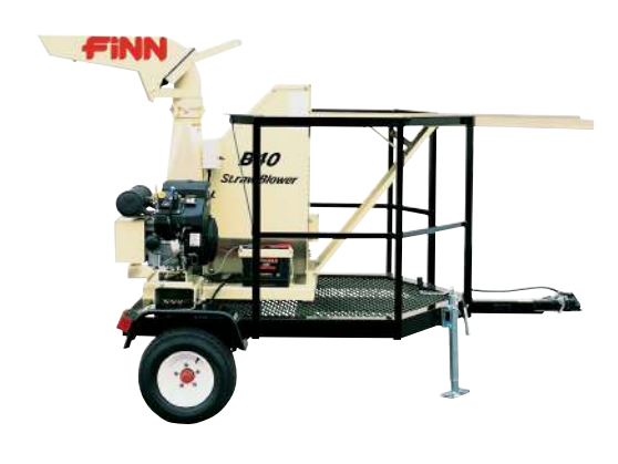
B40 Straw Blower Trailer Mounted (B40T)

As the world leader for over 80 years in the design and manufacture of innovative, quality equipment for the erosion control industry, FINN Corporation is committed to your complete satisfaction.