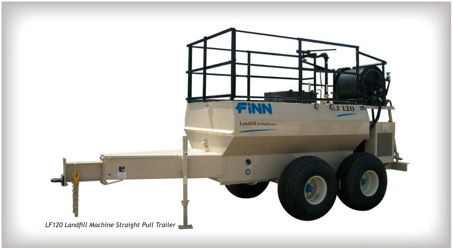
LF120 Landfill Machine Straight Pull Trailer

The FINN LF120 Landfill Machine is a real workhorse with a 1,000 gallon working tank capacity. FINN developed HydroSeeder® technology in 1953. We've been the industry leader in quality and innovation ever since. With the FINN LF120, you don't have to settle for less than proven FINN quality to tackle a wide range of highly demanding hydroseeding applications.