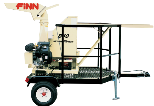
B40 Straw Blower Trailer Mounted (B40T)

As the world leader for over 80 years in the design and manufacture of innovative, quality equipment for the erosion control industry, FINN Corporation is committed to your complete satisfaction.