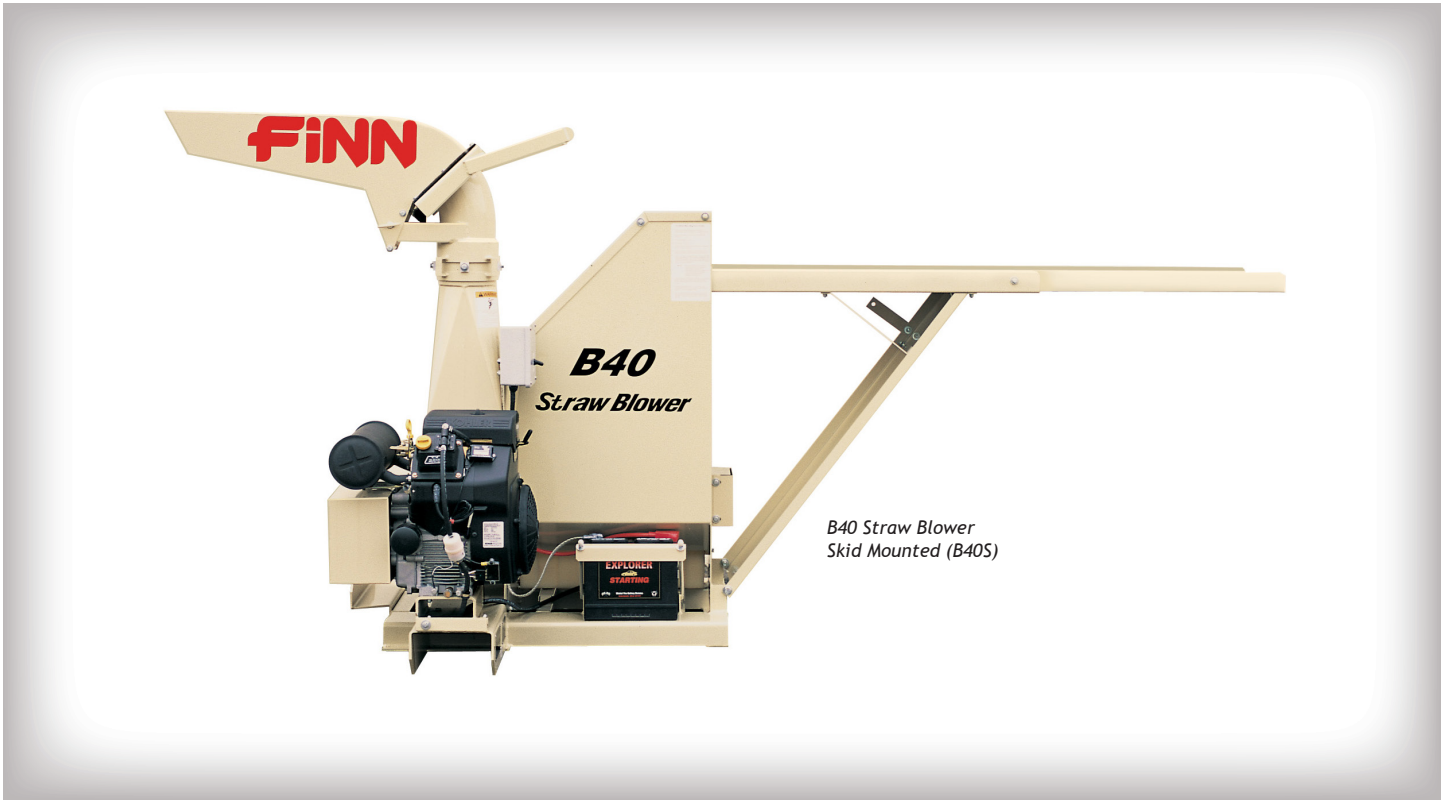
B40 Straw Blower Skid Mounted (B40S)

The FINN B40 Straw Blower brings mulching ease to small landscaping operations. You save time and energy by eliminating tedious and time consuming hand mulching. And because the unit is both self-powered and portable, it's easy for you to mulch in diverse locations.