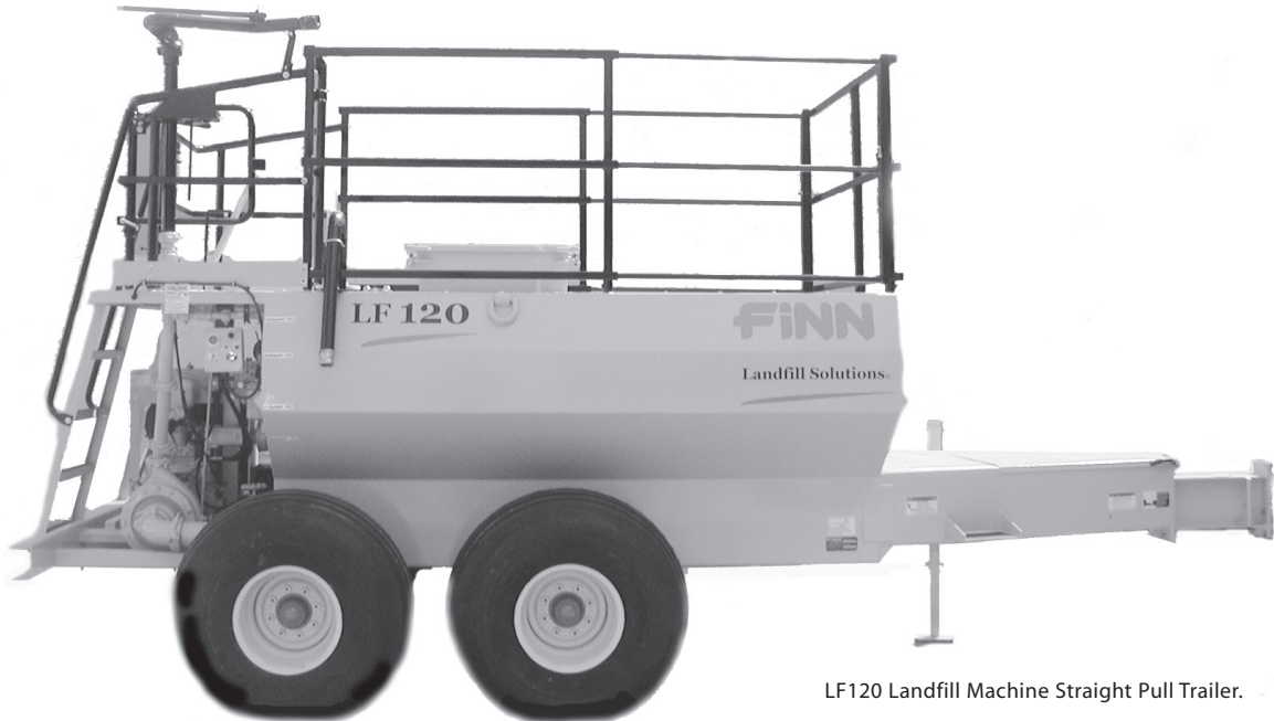
LF120 Landfill Machine Straight Pull Trailer.

The FINN LF120 Landfill Machine is a real workhorse with a 1,000 gallon working tank capacity. FINN developed HydroSeeder technology in 1953. We've been the industry leader in quality and innovation ever since. With the FINN LF120, you don't have to settle for less than proven FINN quality to tackle a wide range of highly demanding hydroseeding applications.