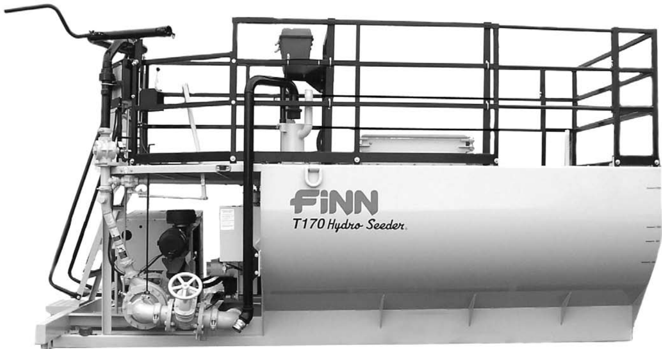
T170 Series II HydroSeeder

The FINN T170 Series II HydroSeeder boasts a top-notch 1,500 gallon tank working capacity engineered to tackle a wide array of mid to larger-sized hydroseeding projects. From large residential and commercial properties, highway roadsides, industrial parks, sports fields, mine reclamation sites and more, the T170 is an economical choice for optimum power, performance and production.