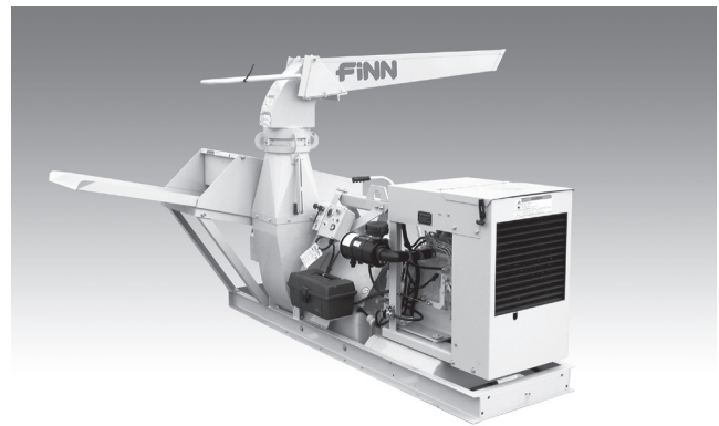
B70, Right Hand Feed, Straw Blower Skid Mounted. (B70S)

As the world leader for over 70 years in the design and manufacture of innovative, quality equipment for the erosion control industry, FINN Corporation is committed to your complete satisfaction.