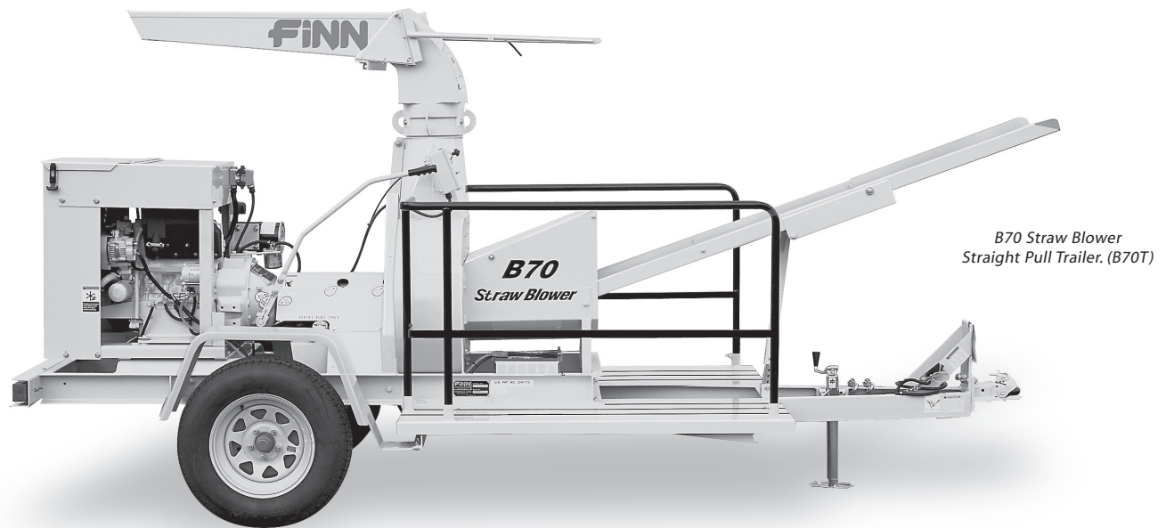
B70 Straw Blower Straight Pull Trailer. (B70T)

The FINN B70 Straw Blower is an ideal performer for all mid-size mulching needs. Designed to handle a wide variety of mulching material, the B70 gives you the high productivity and dependability that is essential for tackling home sites, industrial and commercial projects, and highway roadsides.