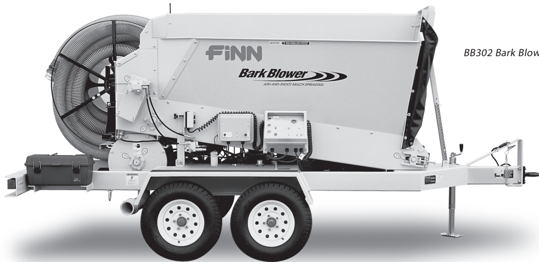
BB302 Bark Blower

The FINN BB302 Bark Blower applies landscape mulch and other bulk materials with unprecedented efficiency, and eliminates the need for labor-intensive hand application. The 1.5 cubic yard hopper is perfect for smaller jobs and hard to reach areas.