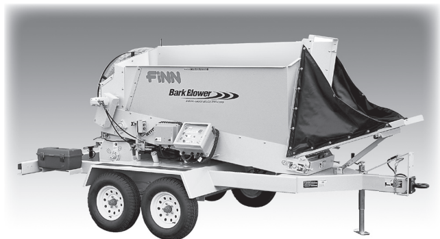
BB302 Bark Blower

As the world leader for over 70 years in the design and manufacture of innovative, quality equipment for the erosion control industry, FINN Corporation is committed to your complete satisfaction.